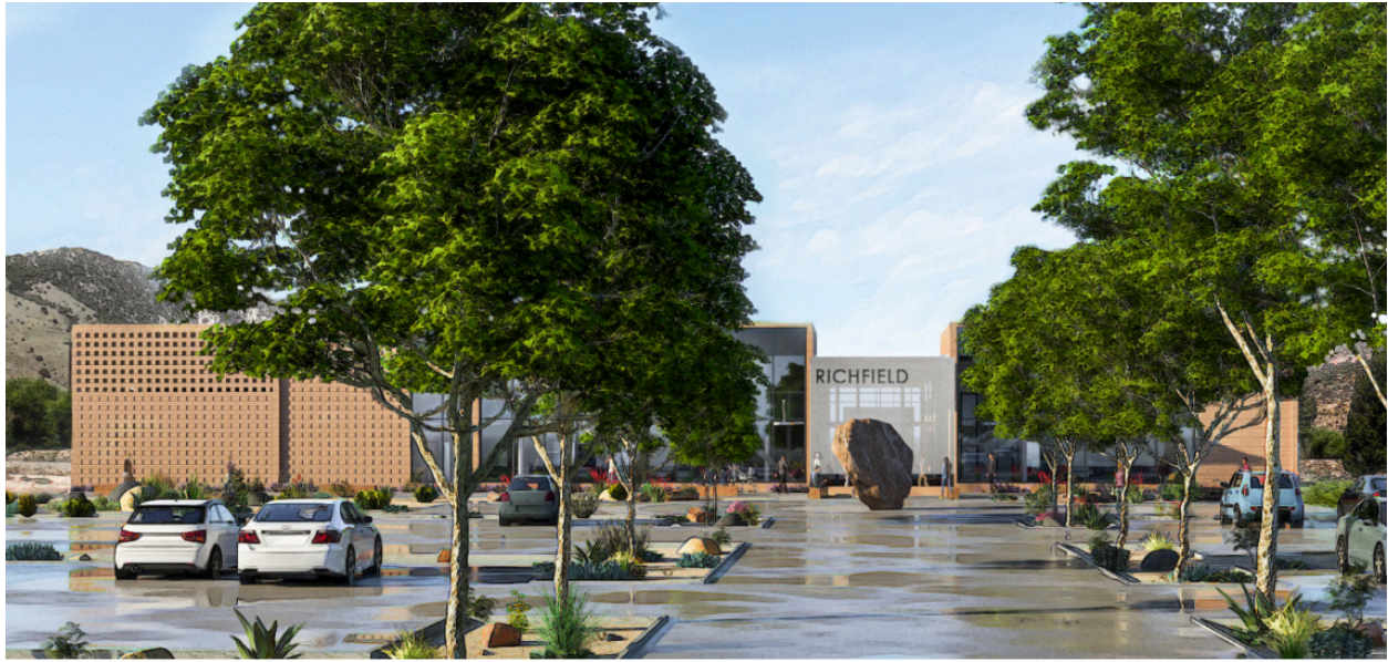
DFCM - Richfield Exterior Renderings and Floor Plan Updates New - Rendering - East Elevation Entry