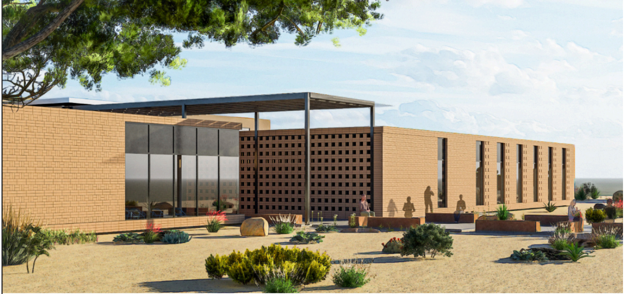
DFCM - Richfield Exterior Renderings and Floor Plan Updates New - Rendering - West Perspective