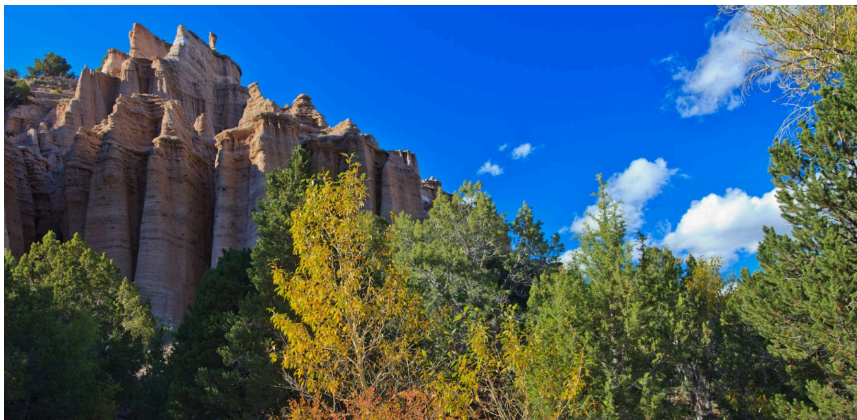
Fremont State Park Hoodoos, by Murray Foubister. 2011. CC BY-SA 2.0

The artwork's subject matter and content must be appropriate for public exhibition and not contain advertising, religious references, sexual or violent content, or convey political partisanship.