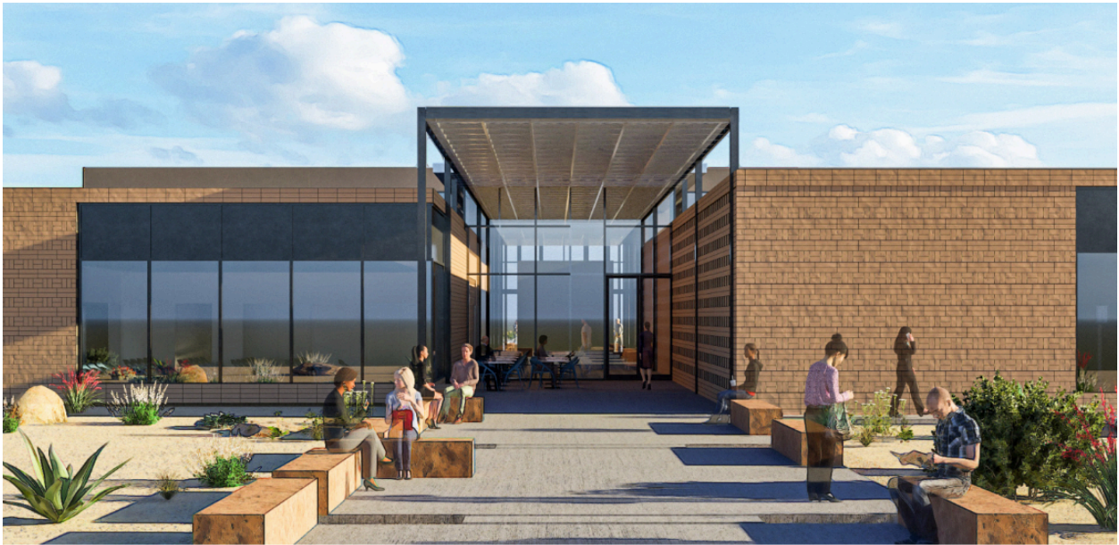
DFCM - Richfield Exterior Renderings and Floor Plan Updates New - Rendering - West Perspective