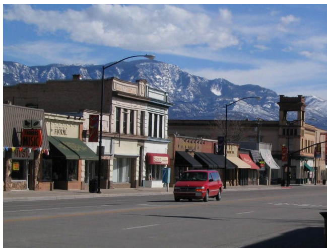
Downtown Richfield, Utah by Ken Lund, 2006.

The Richfield area is known for a number of distinctive historical, cultural, and environmental landmarks. Located just south of the city is the Fremont Indian State Park and Museum, which spotlights the largest known Fremont culture site. Also nearby are the scenic Mystic Hot Springs, Fishlake National Forest, and Pando, the world's largest living organism. As both a key stop on the way through Utah's scenic "Panoramaland" and as an important connection point for local residents, Richfield holds a vital place in Central Utah's way of life.