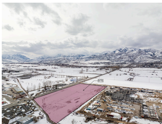
Drone Image of MTech Heber Building site location