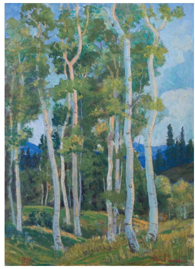
Front Cover: Beyond the Trail (detail), Orson D. Campbell, 1931, State of Utah Alice Merrill Horne Art Collection