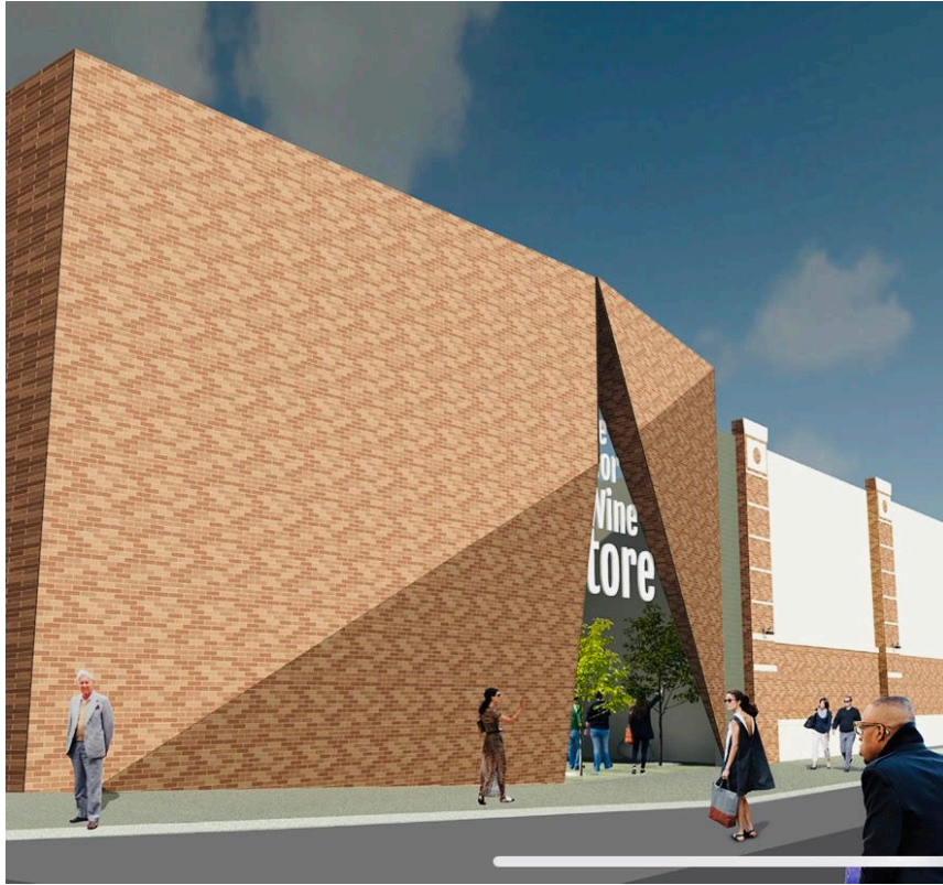
Front exterior rendering