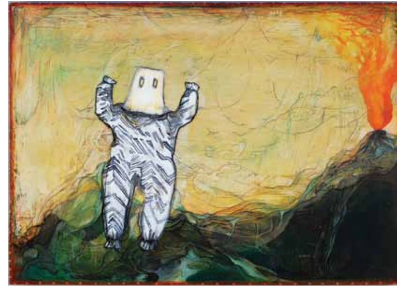
Maureen O'Hara Ure Spook Acrylic and pencil on panel