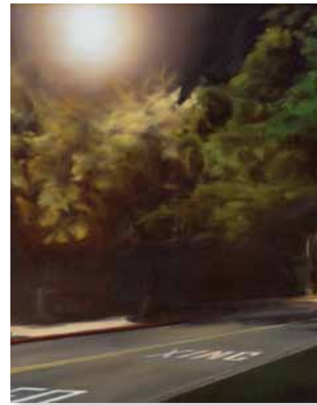
Rebecca Pletsch Street At Night Oil on canvas