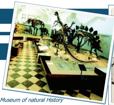
Utah Museum of natural History