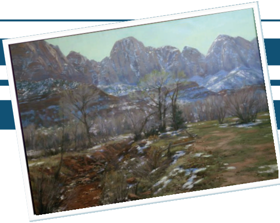
Spring Snow, Zion National Park Oil on canvas by Valoy Eaton