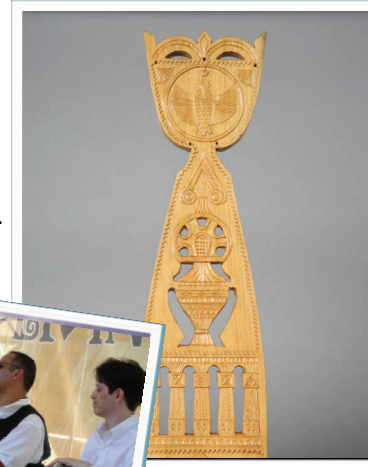
Spinning Board Woodcarving by Nikolay Motro

tional art forms, as well as encourage local investment in traditional folk and ethnic arts. The grant offers matching funds up to $500 to individuals or groups for projects that develop or present community-based, traditional folk art or ethnic art forms.