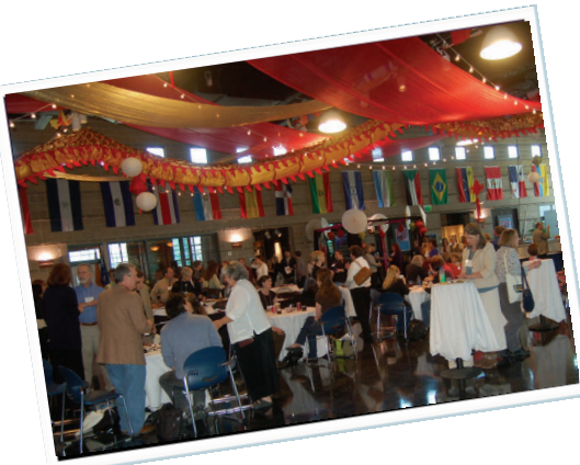
Ruth Draper Lifetime Leadership Award Governor's Leadership in the Arts

The Change Leader Program was initiated in 2002 to address organizational stability through leadership with a focus on leading change. The goals of the program are to not only better equip arts and cultural leaders through certification, conferences and seminars to deal with environmental changes which threaten the sustainability of their organizations and communities; but also to create a statewide mentoring network in the arts and cultural community. After completion of the five-day institute training, Change Leaders need to complete a certification project to become a certified Change Leader, followed by a three-year certification that entails continued professional development opportunities. During the past year, sixteen participants attended the Change Leader Institute and nine leaders became certified. Some of the Certification projects included the publication of a Cultural Heritage Tourism brochure,