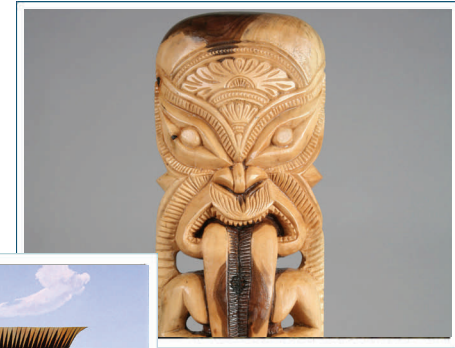
Tiki with Maori Symbols Woodcarving by Tonga Uaisele