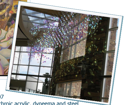
Atmosphere , 2007 11' x 33' x 4', Dichroic acrylic, dyneema and steel installed at College of Eastern Utah San Juan Campus, Blanding