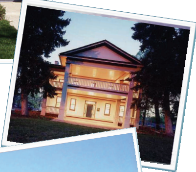
Chase Home Museum 600 East 1100 South, Salt Lake City's Liberty Park