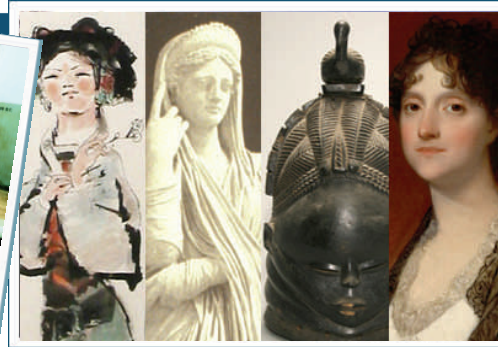
Utah Museum of Fine Art

Office of Museum Services and the Utah Museums Association sponsored Utah Museum Day on February 4, 2008, in the newly-renovated State Capitol to celebrate the contributions of museums. There were 119 people who participated, representing thirty-eight museums. The museums displayed a variety of objects from their collections, including exotic birds and snakes and impressive exhibits of Utah art and history. The event also provided an opportunity for museums to meet with their legislators to discuss the educational value a museum provides the state and to advocate for an increase to OMS grants.