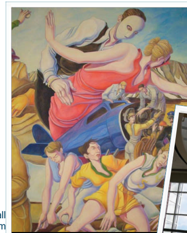
The UVU Story , 2008, 15' x 55' overall Oil on canvas by Robert Barnum installed in the UVU Library, Orem