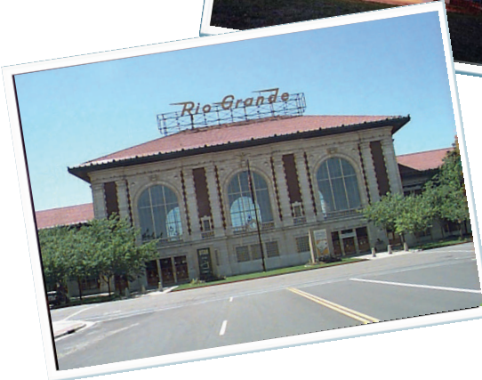
Rio Grande Depot 300 South Rio Grande St Salt Lake City