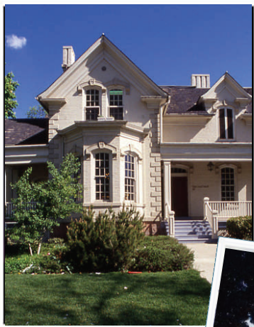
Glendinning Home 617 East South Temple, Salt Lake City