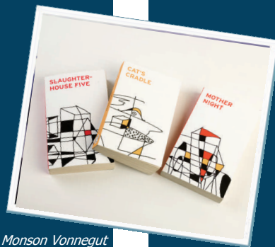
Monson Vonnegut Design Arts Utah '08