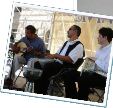
Bazeen Mondays in the Park

The July and August 2007 Mondays in the Park concerts marked the Twentieth Anniversary season of this popular series held in front of the Chase Home Museum of Utah Folk Arts in Salt Lake's Liberty Park. From Hopi and cowboy performers to some of the state's most recent arrivals - - refugees from the Balkans and Africa, the series presented Utah's diverse cultural traditions. The sound of the Scottish bagpipe, Jewish accordion, Japanese koto and the Celtic harp filled the summer evenings while audiences enjoyed the graceful moves of Cambodian court dances and the skill and energy of Hawaiian hula and Mexican Ballet Folklorico. A special concert celebrated the 50 th anniversary of the Salt Lake City – Matsumoto, Japan Sister City relationship with performances by local Japanese musicians and dancers paired with cowboy singers and square dancers.