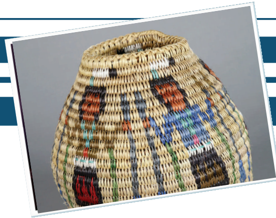
Vessel with Yei Images Navajo Basket by Mary Holiday Black

Focus is centered on perpetuating artistic traditions and skills and maintaining unique cultural identities. Traditional arts include crafts, music, dance and stories passed down through families and communities or within tribal, ethnic or occupational groups. These artistic skills, which reflect the values of earlier generations, are a vital component of community culture, heritage and identity.