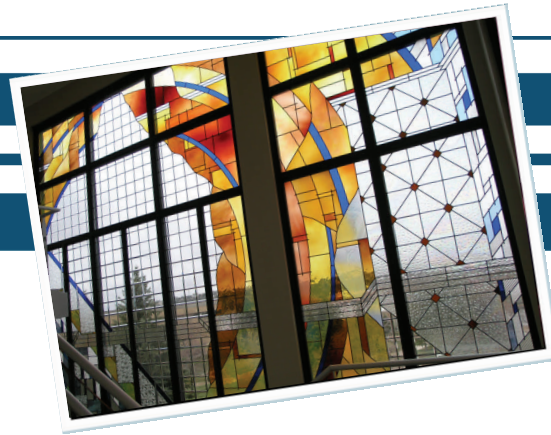
Escher's Elevator , 2008 Approx. 40' x 20', Stained glass and leading installed at SUU, Emma Eccles Jones Education Building, Cedar City

The Public Art Program commissions artists from Utah and nationwide to create site-specific art in and around the public spaces of State facilities throughout Utah. This art, created by artists in collaboration with the community and the facility for which it is being created, enhances and helps build economically healthy and beautiful communities in Utah. These site-specific artworks, commissioned by the Public Art Program and chosen by the community based selection committees, can take the form of architecturally incorporated elements, landscape design, glass, textile, painting and/or sculpture. The program is working to build and add to the quality public art collection belonging to the citizens of Utah.