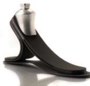
Left: Espiritu . Right: Design Engine .