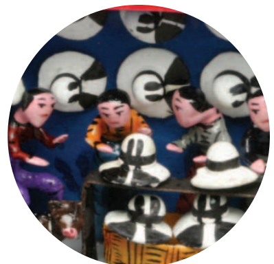
Peruvian retablo of hat makers by Jeronimo Lozano (Salt Lake City)