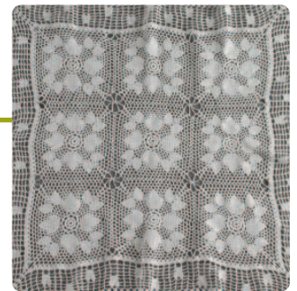
Crocheted Albanian table covering by Roza Androulidakis (North Salt Lake)