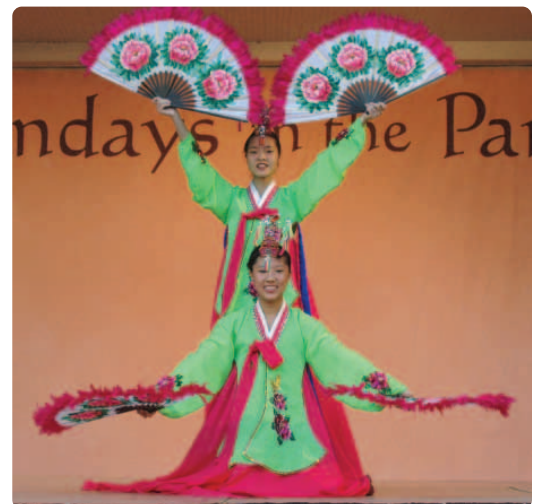
The Korean American Dancers celebrate their ethnic heritage at a Mondays in the Park concert.