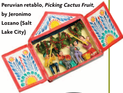
Peruvian retablo, Picking Cactus Fruit , by Jeronimo Lozano (Salt Lake City)