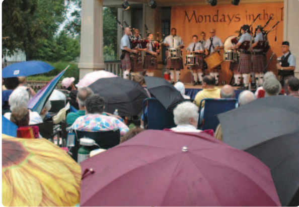
The Salt Lake Scots perform at a Mondays in the Park concert at the Chase Home Museum of Utah Folk Art.

Forming and strengthening cultural partnerships is a vital component of creative community building. In the Change Leader Institute, a leadership development seminar offered by UAC Community Partnerships Program, participants learn critical skills to creatively weave together the cultural fabric of their communities.