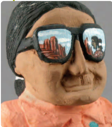
Navajo woodcarving by Rena Juan (Bluff); complete image on page 5