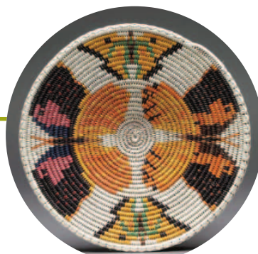
Navajo basket of butterflies by Jonathan Black (Mexican Hat)